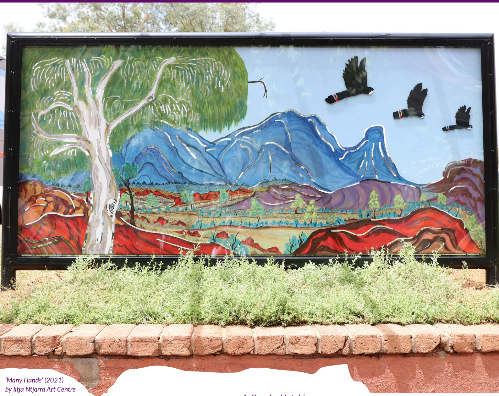
'Many Hands' (2021) by Iltyja Ntjarra Art Centre