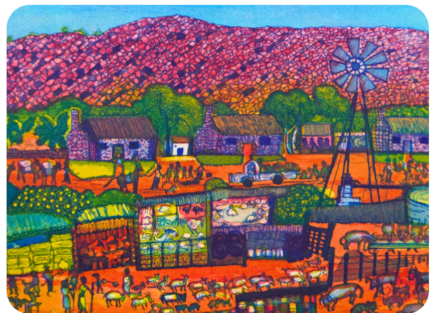
Ration Day at Urrampinyi (Tempe Downs) (2024) by Selma Coulthard